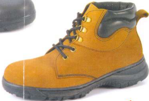
TS 1711 < 7" Lace-up High Leg 3D-Ring Boot in Nubuck Khaki c/w S.T.C.