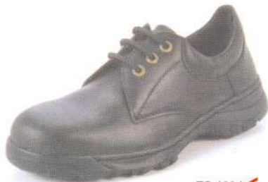
TS 1334 < 3" Lace-up Shoe in Waxy Black c/w S.T.C.