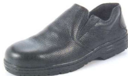
> TS 303 3" Slip-on Shoe in Black Barton Print c/w S.T.C.