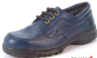
TS 1333 < 3" Lace-up Shoe in Navi Blue c/w S.T.C.