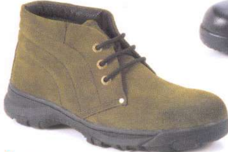
> TS 1531 5" Lace-up Boot in Suede Khaki c/w S.T.C.