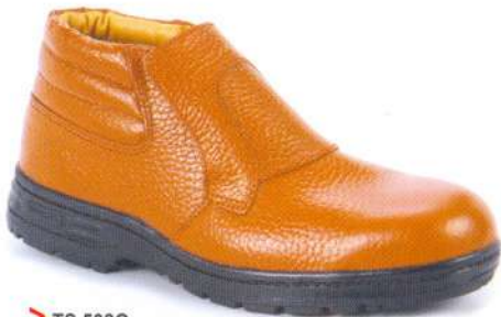
> TS 5020 5" Slip-on Boot in Brown Rambler Print c/w S.T.C.