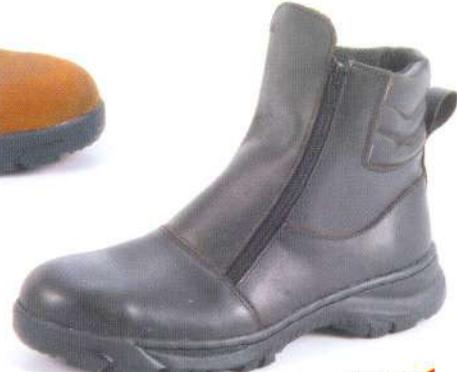
TS 1702 < 7" Zip-up High Leg Boot in Waxy Black c/w S.T.C.