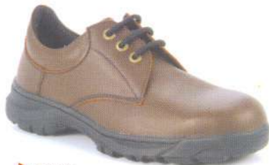
> TS 1334 3" Lace-up Shoe in Waxy Brown c/w S.T.C.