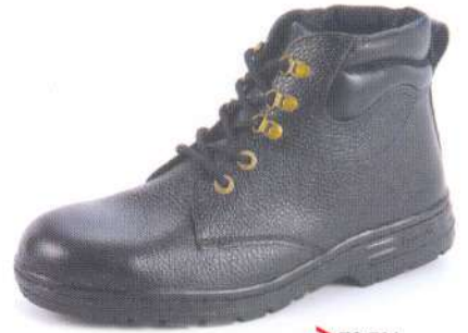
> TS 701 7" Lace-up High Leg 3D-Ring Boot in Black Barton Print c/w S.T.C.