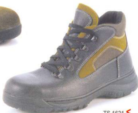
TS 1621 < 6" Lace-up 5D-Ring Boot in Black & Khaki c/w S.T.C.