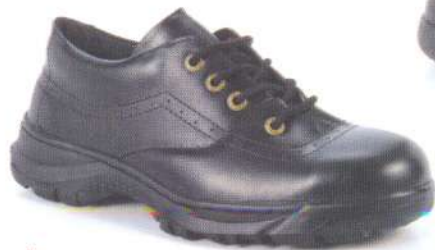
> TS 1331 3" Lace-up Shoe in Black Colour c/w S.T.C. > TS 1116 3" Lace-up Shoe in Black Colour w/o Toe Cap