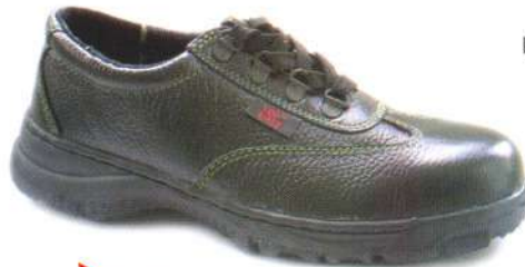
> TS 1709 3" Lace-up Shoe in Black Barton Print c/w S.T.C.