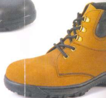
TS 1711 7" Lace-up High Leg 3D-Ring Nubuck Khaki c/w S.T.C.