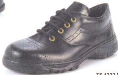
TS 1332 < 3" Lace-up Shoe in Black Colour c/w S.T.C.