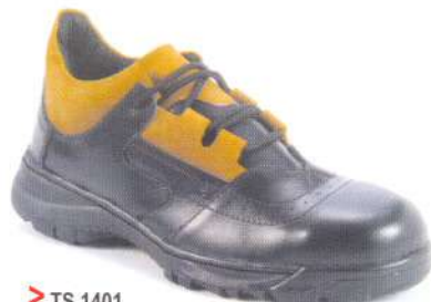
> TS 1401 4" Lace-up Shoe in Black & Khaki c/w S.T.C.