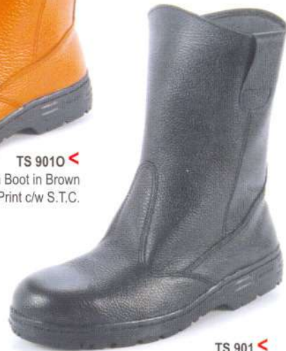
TS 901 < 9" Slip-on Boot in Black Barton Print c/w S.T.C.