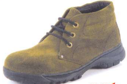
TS 1511 < 5" Lace-up Boot in Suede Khaki c/w S.T.C.