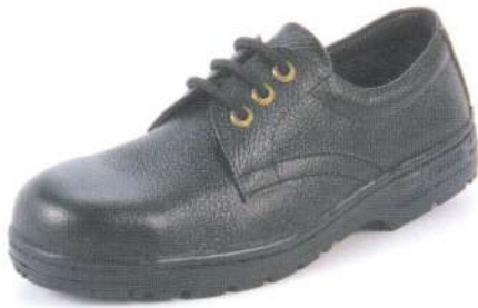
> TS 301 3" Lace-up Shoe in Black Barton Print c/w S.T.C.