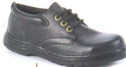
TS 201 < 3" Lace-up Ladies Shoe in Black Barton Print c/w S.T.C.