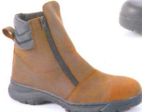
> TS 1702 7" Zip-up High Leg Boot in Oil-pull Brown c/w S.T.C.