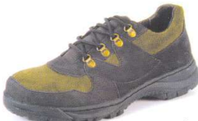
TS 1411 < 4" Lace-up Shoe in Black & Khaki c/w S.T.C.