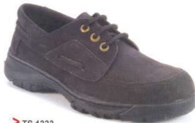
> TS 1333 3" Lace-up Shoe in Nubuck Black c/w S.T.C.