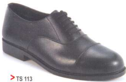
> TS 113 Lace-up Executive Shoe in Black Colour w/o S.T.C.