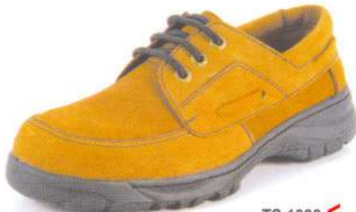
TS 1333 < 3" Lace-up Shoe in Nubuck Khaki c/w S.T.C.