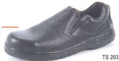
TS 203 < 3" Slip-on Ladies Shoe in Black Barton Print c/w S.T.C.