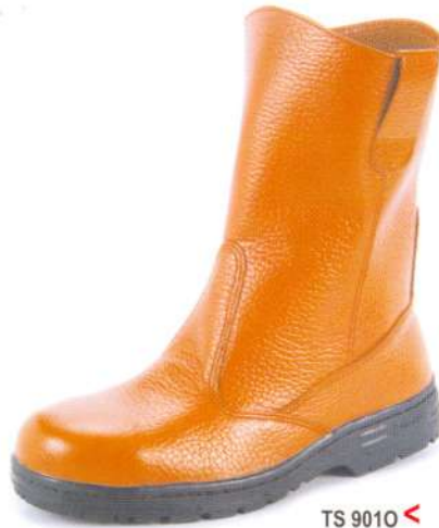
TS 9010 < 9" Slip-on Boot in Brown Rambler Print c/w S.T.C.