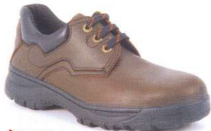
> TS 1421 4" Lace-up Shoe in Waxy Brown c/w S.T.C.