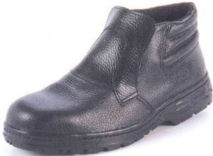
> TS 502 5" Slip-on Boot in Black Barton Print c/w S.T.C.