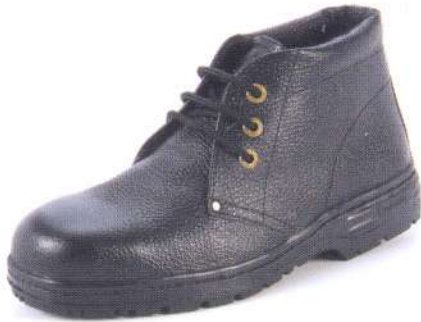
> TS 501 5" Lace-up Boot in Black Barton Print c/w S.T.C.