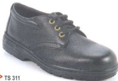
> TS 311 3" Lace-up Shoe in Black Barton Print c/w S.T.C.