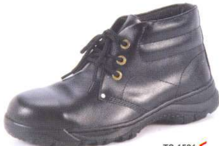
TS 1521 < 5" Lace-up Boot in Black Colour c/w S.T.C.