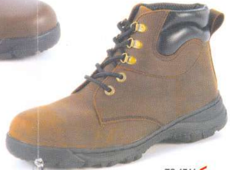
TS 1711 < 7" Lace-up High Leg 3D-Ring Boot in Oil-pull Brown c/w S.T.C.