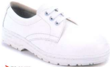
> TS 301W 3" Lace-up Shoe in White Barton Print c/w S.T.C.