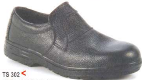
TS 302 < 3" Slip-on Shoe in Black Barton Print c/w S.T.C.