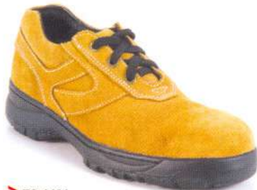
> TS 1431 4" Lace-up Shoe in Suede Beige c/w S.T.C.