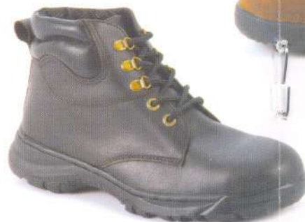
> TS 1711 7" Lace-up High Leg 3D-Ring Boot in Waxy Black c/w S.T.C.