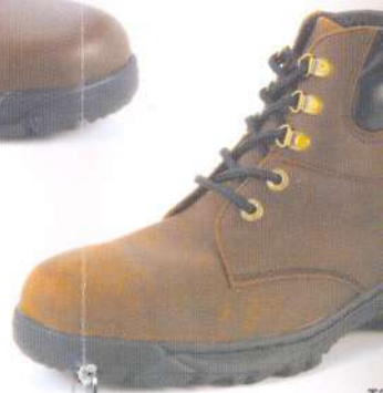
TS 1711 7" Lace-up High Leg 3D-Ring Oil-pull Brown c/w S.T.C.