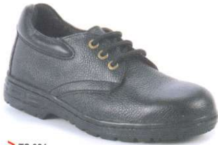
> TS 321 3" Lace-up Shoe in Black Barton Print c/w S.T.C.