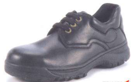
TS 1421 < 4" Lace-up Shoe in Waxy Black c/w S.T.C.