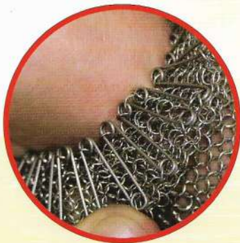
With Integrated stiffeners