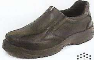
TS 8304 3" SLIP-ON SHOE IN FULL GRAIN BLACK BARTON LEATHER