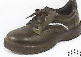
TS 8306 3" LACE-UP SHOE IN FULL GRAIN BLACK BARTON LEATHER