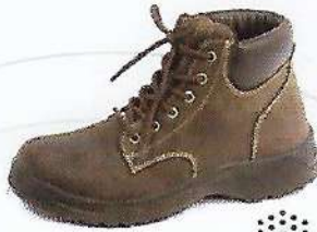
TS 8722 7" LACE-UP ANKLE BOOT IN FULL GRAIN OIL PULL-UP BROWN LEATHER