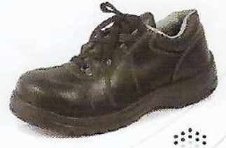
TS 8481 4" LACE-UP SHOE IN FULL GRAIN WAXY BLACK LEATHER