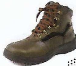
TS 8822 8" LACE-UP ANKLE BOOT IN FULL GRAIN OIL PULL-UP BROWN LEATHER