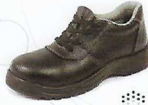
TS 8461 3" LACE-UP SHOE IN FULL GRAIN BLACK BARTON LEATHER