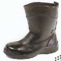
TS 8902 9" SLIP-ON BOOT IN FULL GRAIN BLACK BARTON LEATHER