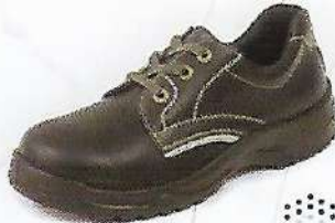
TS 8305 3" LACE-UP SHOE IN FULL GRAIN BLACK BARTON LEATHER