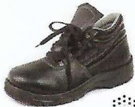
TS 8651 6" LACE-UP ANKLE BOOT IN FULL GRAIN BLACK BARTON LEATHER