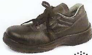
TS 8451 4" LACE-UP SHOE IN FULL GRAIN BLACK BARTON LEATHER