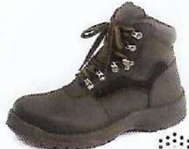
TS 8822 8" LACE-UP ANKLE BOOT IN FULL GRAIN WAXY BLACK LEATHER