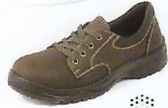
TS 8322 3" LACE-UP SHOE IN FULL GRAIN OIL PULL-UP BROWN LEATHER