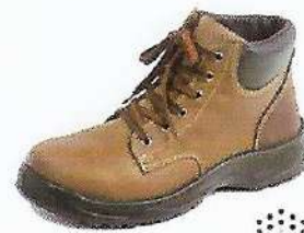
TS 8722 7" LACE-UP ANKLE BOOT IN FULL GRAIN CRAZY HORSE BROWN LEATHER