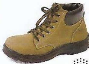
TS 8722 7" LACE-UP ANKLE BOOT IN FULL GRAIN NUBUCK KHAKI LEATHER